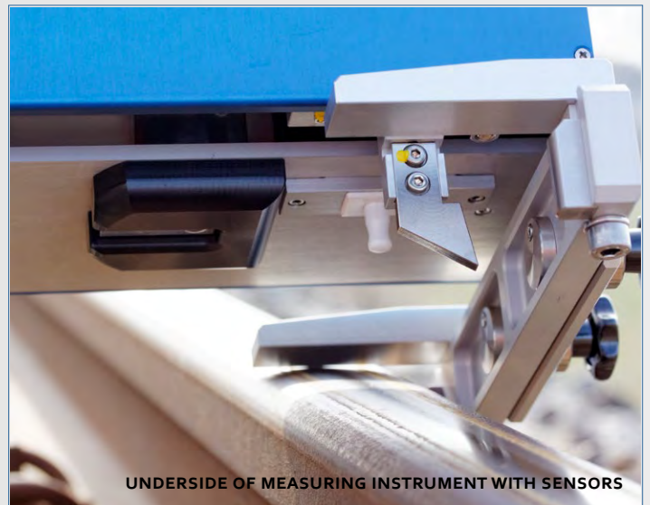
UNDERSIDE OF MEASURING INSTRUMENT WITH SENSORS